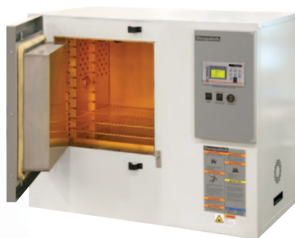
RAD1-42 benchtop oven

*50 hertz electrical is available on all models